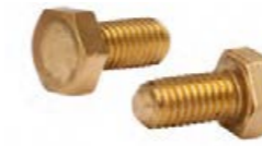
DIN 933 - brass - M8 x 16