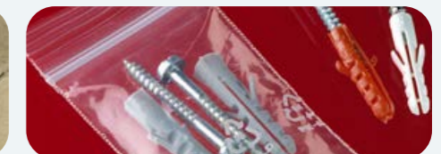
Bag packaging (e.g., two screws & two dowels)