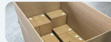
Bulk packaging (up to 20 kg per covering box)