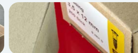
Small packaging (100/200/500 pieces)